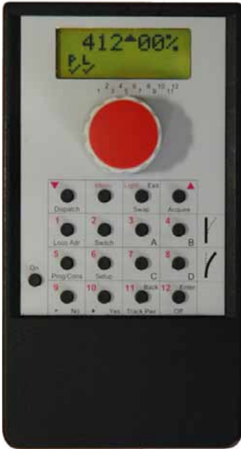
R/C Throttle in original size