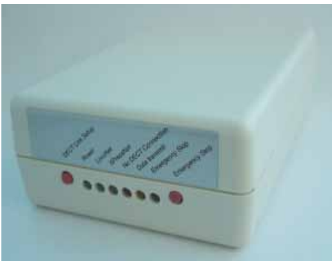
BaseUnit standard version (above) with external antennas (below)